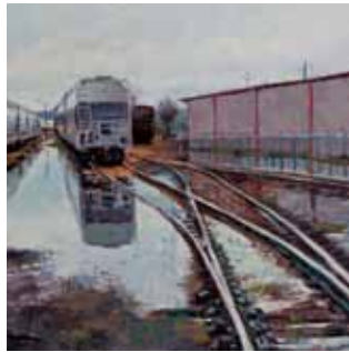
Jason Sacran "Flooded Train Yard"