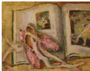
Virginia Pendergrass, AIS "How-To Book"