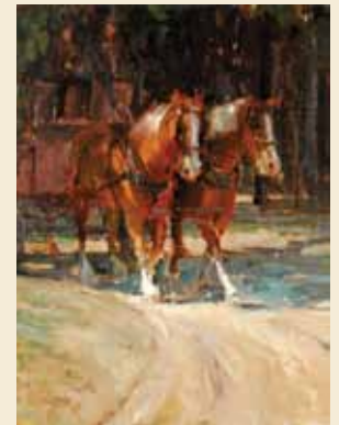
Third Place Kyle Paliotto "Summer Stroll"